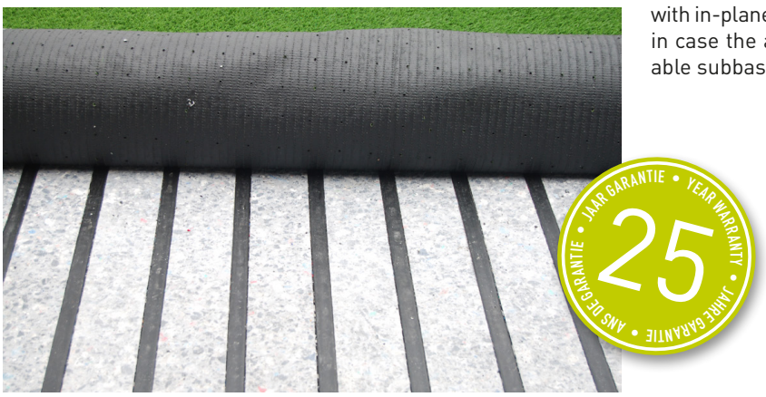
ProPlay®-HP23el is delivered in rolls with on the upperside channels for carrying electric heating elements. This picture includes the electric heating elements.

The product performs in all weather conditions and is renowned for its excellent water permeability. If desired it can be delivered with in-plane drainage channels, offering excellent lateral drainage in case the artificial grass system is to be built on an impermeable subbase.