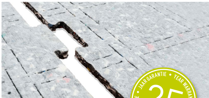
Puzzle shaped ProPlay ® sheets with expansion slots